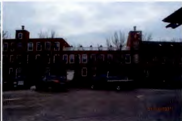
Mixed Use Mill – River St. 20 units?