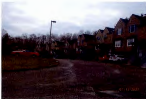
Edge wood condominiums – 85 units with appraised values of $90k average