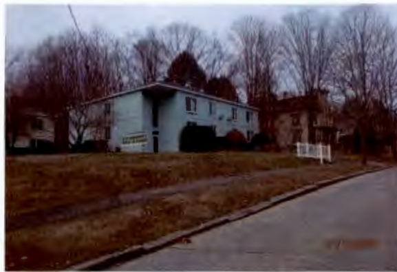
EDGEWOOD Apartments 24 units