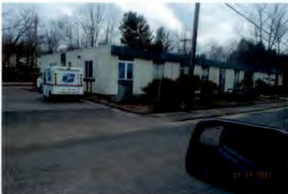
West Street Units 5 units