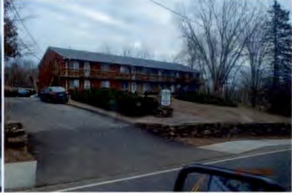
West Brook Garden Apartments 32 units