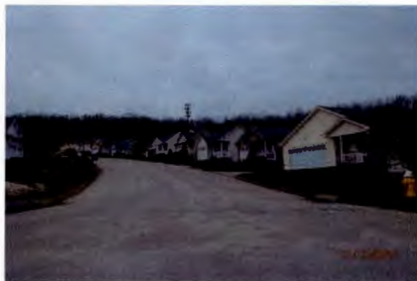
Isabella Court is a 55+ development of 92 clustered single family homes with an average appraised value of $150k to 160k