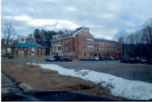
East Street – Former Hospital 28 units