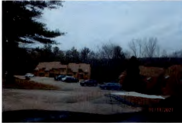
Forest Edge condominiums - 72 units with appraised values of 115K average